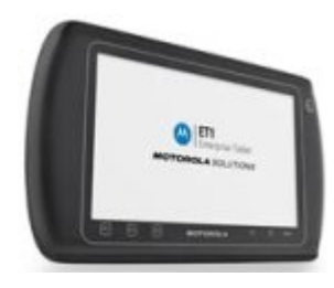
Motorola ET1: 7-inch Android-based enterprise tablet

Motorola Solutions also introduced a potentially very significant product: its first new era, post PC enterprise-oriented tablet with wide-format 7-inch form factor, capacitive multitouch, Android operating system, sensors and cameras and all. The new ET1 tablet, which despite being